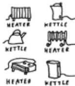
PORTABLE CHURCH APPLIANCE TESTING